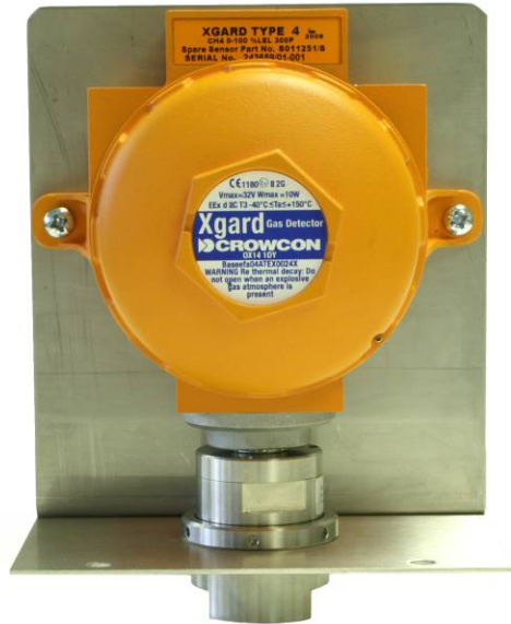
Figure B: Front View