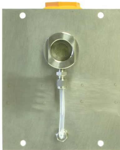
Figure C: Bottom (Duct-Side) View