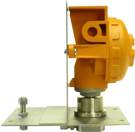
Figure A: Side View